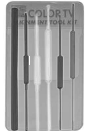
T0617– Universal Alignment Kit

An Inexpensive Utility Duster/Cleaner. Zinc Plated Steel Handle Holds The Fibers In Place. Excellent For Use With Solvents, Fluxes, Etc. Reusable. 6" long by 1/2" Wide. Three Per Pack