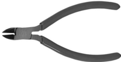
T0577 – Xcelite Midget Diagonal Pliers For Work In Close Quarters. 4" Diagonal Pliers with Red Cushion Grip Handles. Xcelite# 54CG