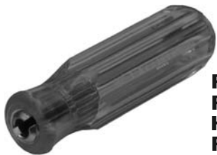
T0351 Xcelite Replacement Handles

Xcelite# 99X5, 4" – Stock# T0210 Xcelite# 99X10, 7" – Stock# T0211