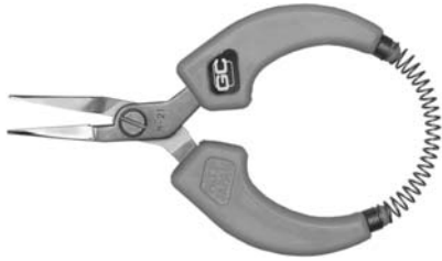
T0656 – Palm-Grip Needle-Nose Pliers

Pliers Feature Rustproof Stainless Steel Working Ends And Lightweight, Durable Molded Handles. Designed For Hours Of Uninterrupted Use Without Cramping. Spring-Loaded With Minimal Travel