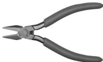
T0381 – Xcelite Flush-Cut Diagonal Pliers Tapered Head, Flush-Cutting 5" Diagonal Pliers Green Cushion Grip Handles Xcelite# 95CG