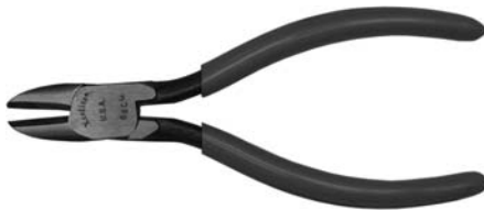
T0578 – Xcelite Diagonal Pliers 6" All-purpose Side Cutting Pliers with Red Cushion Grip Handles. Xcelite# 66CG