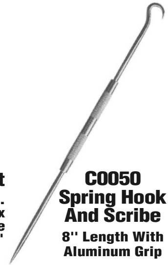
C0050 Spring Hook And Scribe

Cadmium-Plated Hardened Steel. Consists Of Nine Short Hex Wrenches: 0.050" To 1/4" And Nine Long Hex Wrenches: 5/64" To 5/16"