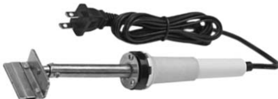
X5125 – "Hot Blade" Decal Remover

This Kit Includes Five Different Alignment Tools For All Standard Adjustments On Game Monitors. Each Tool Color-Coded For Easy Identification. Included Is The "Extend-It" To Make Long Reach Aligners Out Of Each Tool. This Handy Kit Is Packaged In A Pocket-Saver Pouch