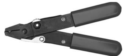
T0582 – Xcelite Wire Stripper For Industrial Use. Unique Cam Stop Adjustment For Different Wire Sizes. Cam Stays Put Even With Screw Loose. Red Plastic-Coated Cushion Grip Provides Maximum Leverage Xcelite# 103SV

6880 South Emporia Street Centennial, Colorado 80112 303-790-0885 - 303-790-0746 - FAX Toll-Free: 1-800-525-7059