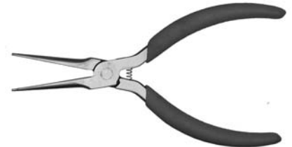
T0579 – Xcelite Diagonal Pliers 5-11/16" Standard Needle Nose Pliers with Red Cushion Grip Handles. Xcelite# 57CG