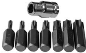
T1606 8-Piece Tamper Proof Star Bit Set