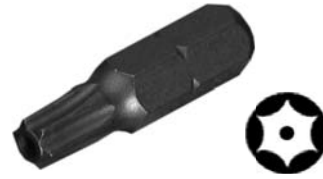
Individual Torx Security Bits