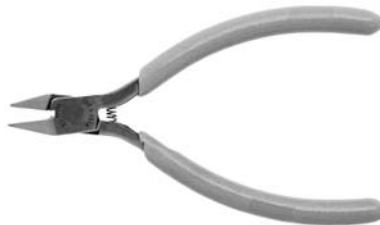
T0380 – Xcelite Tapered-Nose Pliers Midget 4" Full-Flush Cutting Taper Nose Pliers. Polished Oval Joint. Xcelite# 84CG